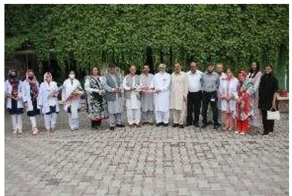
CPSP team visit WMC - June 2022