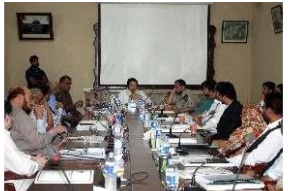
PM&DC Inspection Team

Women Medical College was initially affiliated with University of Peshawar from 2000 to 2009. Then it got affiliated with Khyber Medical University, Peshawar in 2010. The KMU was established in January 2007 and is the first Medical University of Health Sciences in Khyber Pukhtunkhawa. The University conducts professional examinations in MBBS and BDS. In addition the university conducts the postgraduate, nursing, medical technology and physiotherapy exam. The university has a mandate to uplift the medical education not only nationally but internationally. All Medical & Dental colleges of public & private sector of K.P.K are affiliated with KMU.