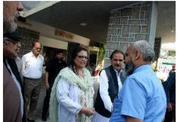
PM&DC Inspectors visit to WMC

It is a national statutory body of the country that regulates the Medical Profession in general and monitor the medical education in particular. The College was initially recognized for 50 students in the year 2003 by PM&DC and thereafter in year 2007, for admission of 100 students per year purely on its meritorious grounds of teaching and training.