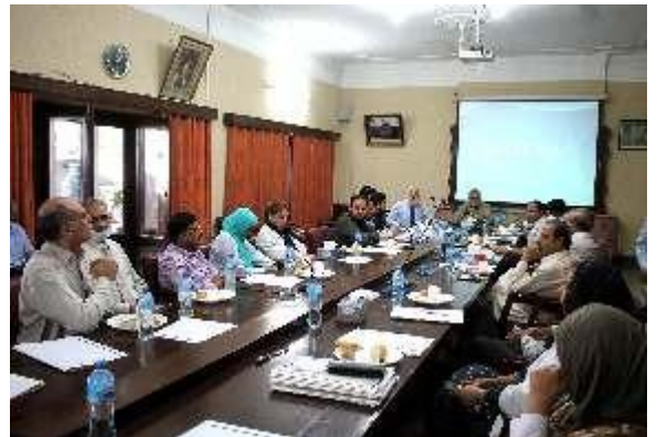
K.P HERA inspection team visit to WMC

HERA is a Provincial Higher Education Regulatory Authority that is responsible to regulate and monitor the standard of teaching in all educational institutions, including Medical education, in the province. WMC enjoys its confidence and blessings of recognition since its inception.