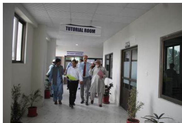
PM&DC Inspectors visit to WMC

It is a national statutory body of the country that regulates the Medical Profession in general and monitor the medical education in particular. The College was initially recognized for 50 students in the year 2010 by PM&DC per year purely on its meritorious grounds of teaching and training.