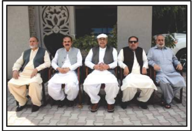
Executive Members of PEPS