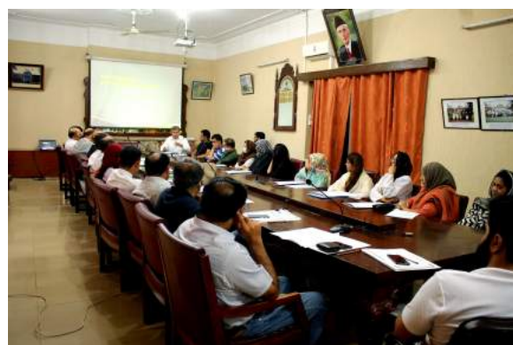
CPSP team visit WDC - June 2022