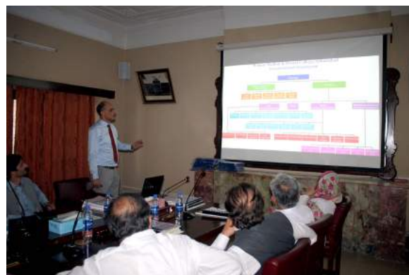
PM&DC Inspection Team