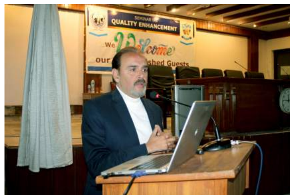
K.P HERA inspection team visit to WDC

HERA is a Provincial Higher Education Regulatory Authority that is responsible to regulate and monitor the standard of teaching in all educational institutions, including Medical education, in the province. WDC enjoys its confidence and blessings of recognition since its inception.